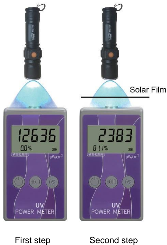
Figure 1. Measure the UV rejection performance of window film