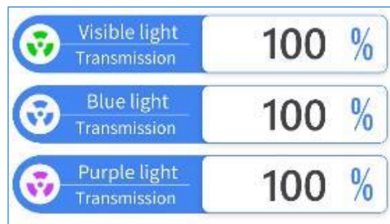
Visible light /blue light /purple light transmission

Select "VLT+BL/UV Rejection+UV400", the measurement interface displays: visible light transmission, blue light rejection, ultraviolet rays rejection, UV400. (Default)