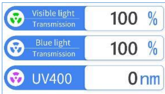
Visible light /blue light transmission+UV400