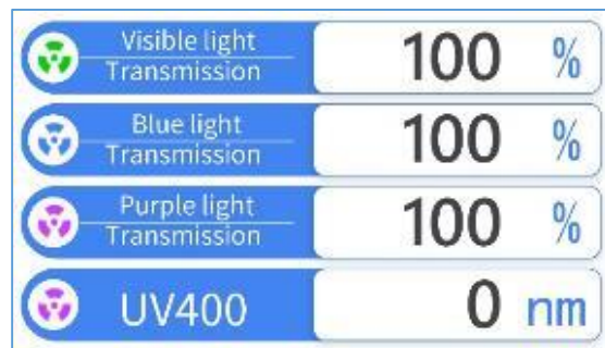
VLT /blue light/purple light transmission+UV400