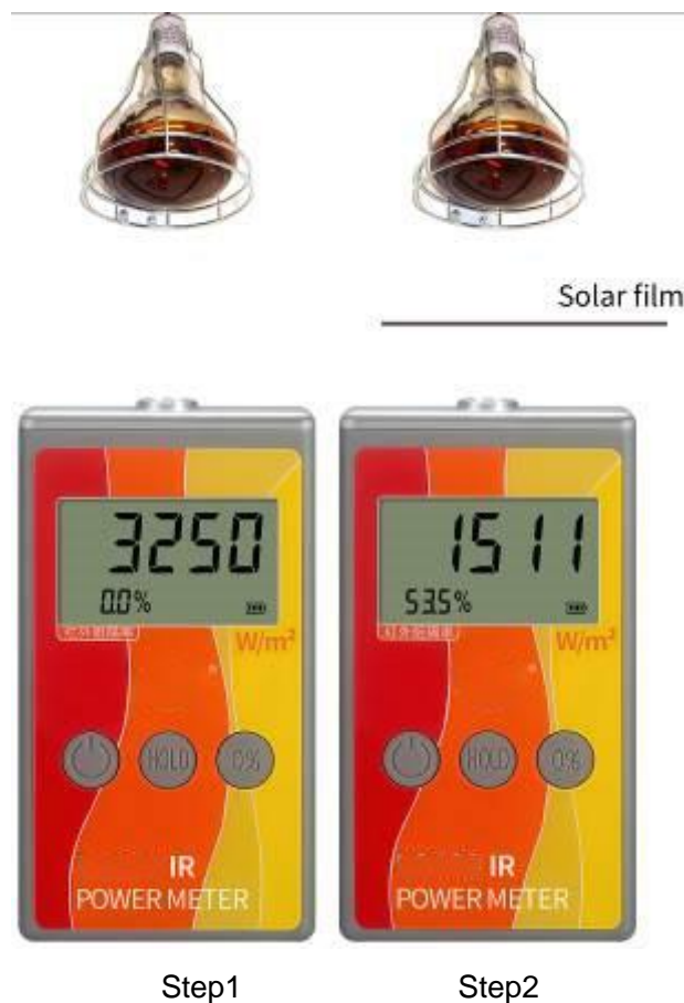
Figure1: Measuring the infrared rejection rate of solar film

To measure the infrared rejection rate of solar films and insulated glass, etc, two steps shall be carried out: