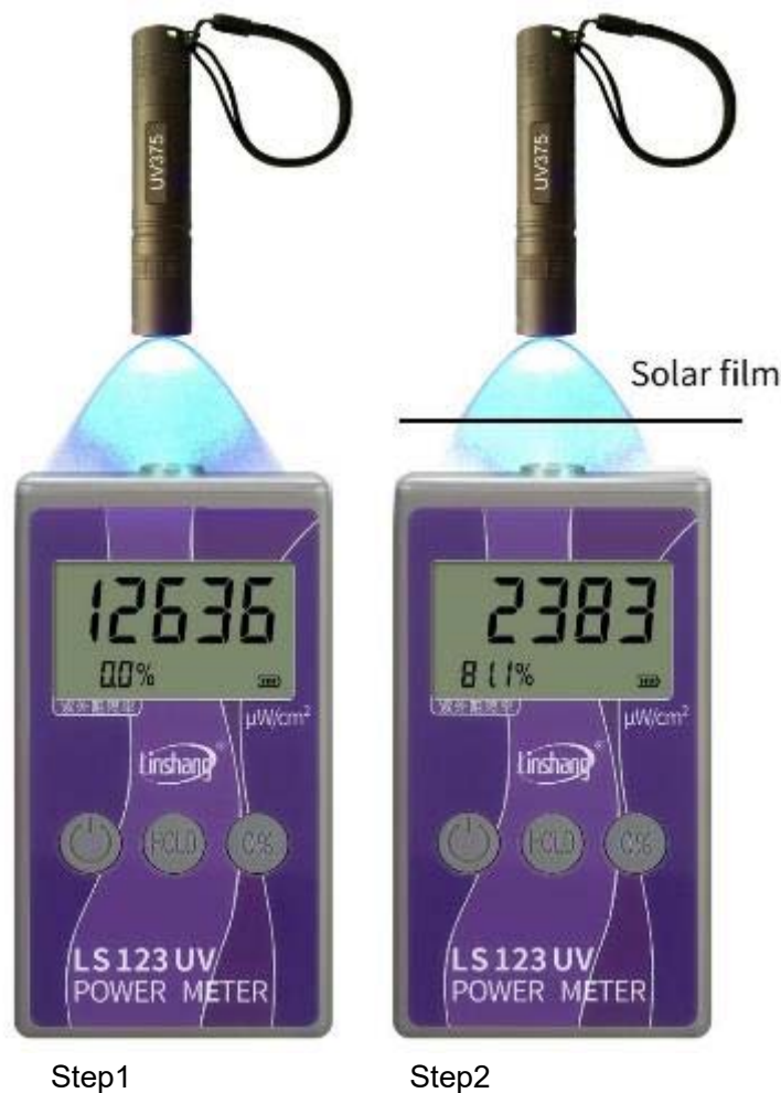
Figure1: Measuring the UV rejection rate of solar film

To measure the UV rejection rate of solar films and insulated glass, etc, two steps shall be carried out: