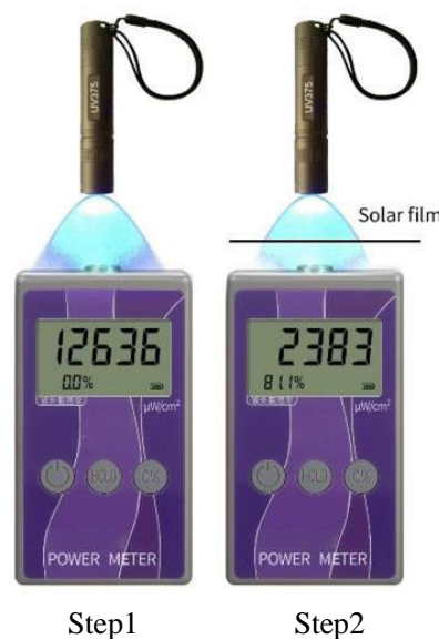
Figure1: Measuring the UV rejection rate of solar film

To measure the UV rejection rate of solar films and insulated glass, etc, two steps shall be carried out: