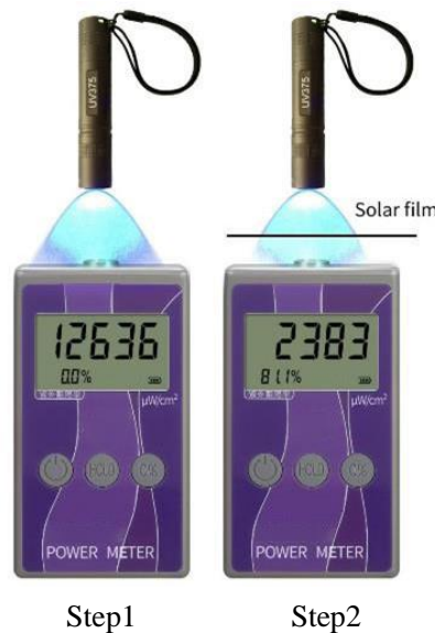
Figure1: Measuring the UV rejection rate of solar film

To measure the UV rejection rate of solar films and insulated glass, etc, two steps shall be carried out: