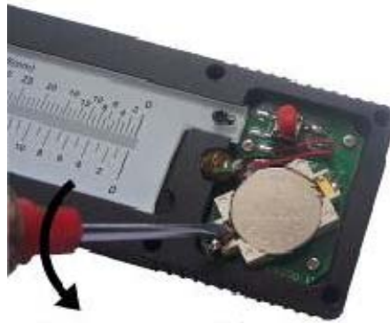
Replace the battery